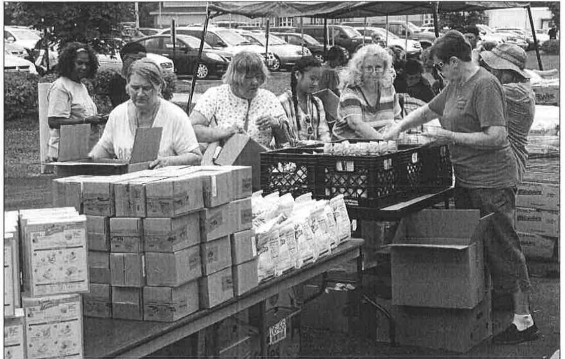
ABOVE: People line up for free food Saturday from the Northern Illinois Food Bank at the annual Sharefest in New Lenox.

She said she noticed all the free services offered at the event, which she